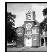
St. Genevieve Church Parish

417 East Simcoe Lafayette, La 70501 (318) 234-5147